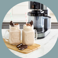
Fill, freeze, process and enjoy