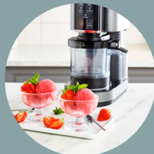
Much more than ice cream