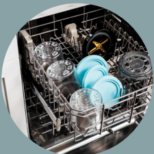
Dishwasher safe parts